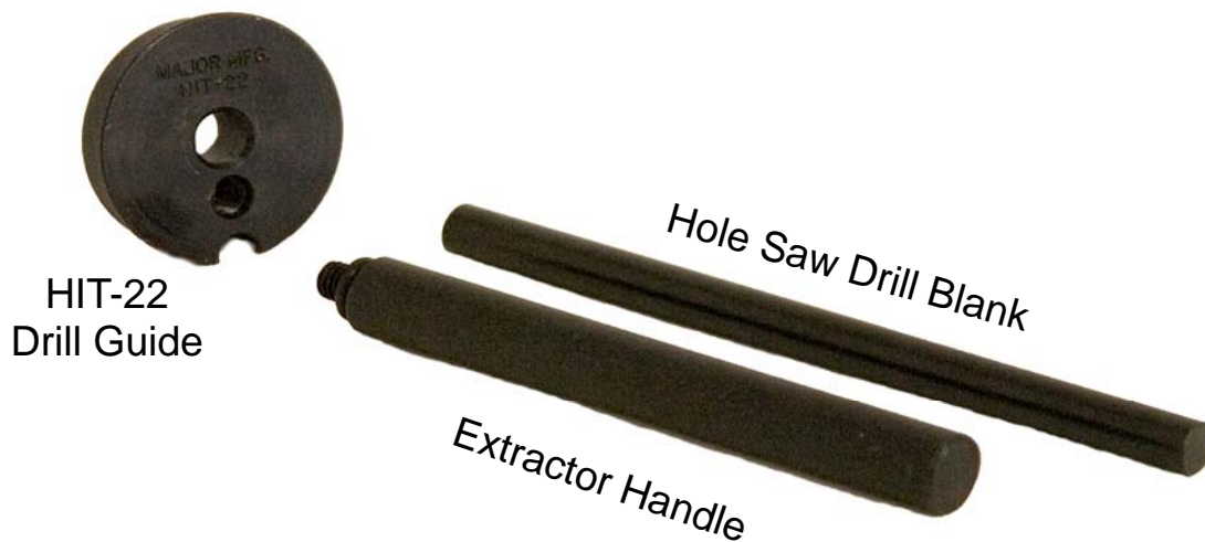
HIT-22 Drill Guide